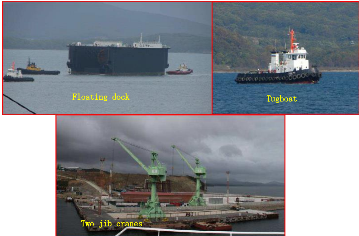
Figure 2 Provided equipment (Floating dock, Tugboat and two Cranes)