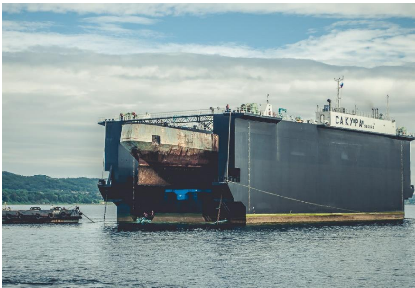
Figure 4 Nuclear service ship in the floating dock (stern showing out of the floating dock)

The floating dock has also been used for lifting nuclear service ships from the sea. The operation that the 3CRUs lifted from the sea by using the floating dock has influenced the operation in the on-shore storage program in the Russian North West. The equipment, together with the transport equipment provided by Germany, has had a synergistic effect on the transportation of the 3CRUs. The presence of the on-shore storage facility has had a positive effect on the local economy, such as an increase in employment and in revenues of participant companies in the city of Fokino. Thus, a positive impact has been observed. Below is the assessment result for each item.